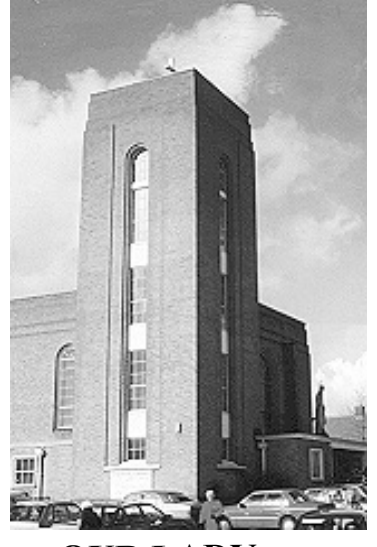
OUR LADY, OUEEN OF APOSTLES